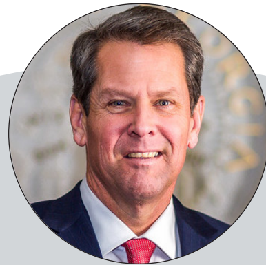
BRIAN KEMP Governor of Georgia